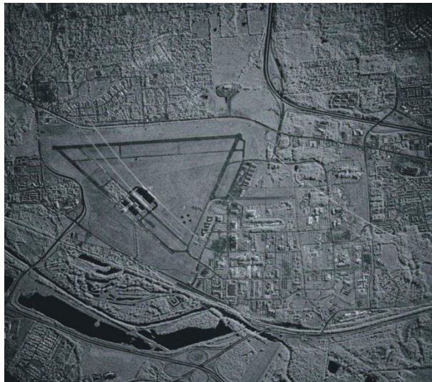
Figure 2: SAR Image

The GSI server application receives the SAR raw data in H5 file format, which includes 2 files—the Pulse file and the DTM file. Using Fast Back Projection (FBP) processed on GSI APU hardware, it is able to analyze the intensity of the radar beams projected back from the ground to the platform and to form an image of the area.